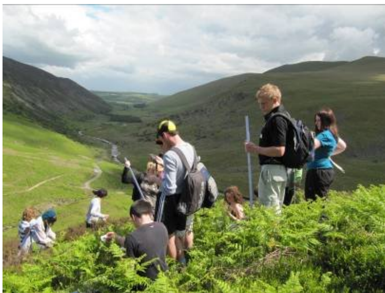
Sixth Form Students' Biology Fieldwork Summer 2009

Outside applications – An application form can be downloaded from the website – www.rytoncs.co.uk – by following the Parents / Year 11 options link. It is advisable to also arrange an interview with either Mrs Short or Mrs French by ringing the Sixth Form office on 0191 4132113 ext 208.