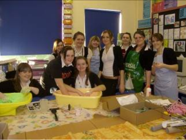
CACHE Early Years students