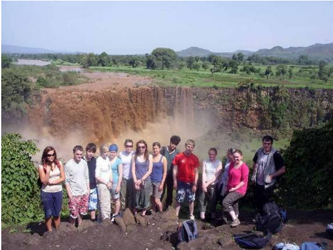
Sixth Form students in Ethiopia during the Summer of 2009