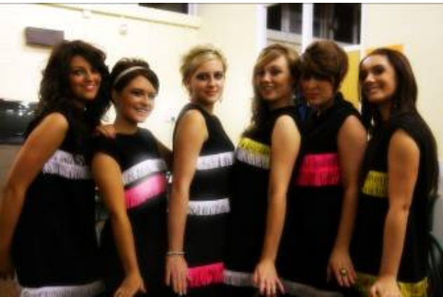
6 th Form Dance Group