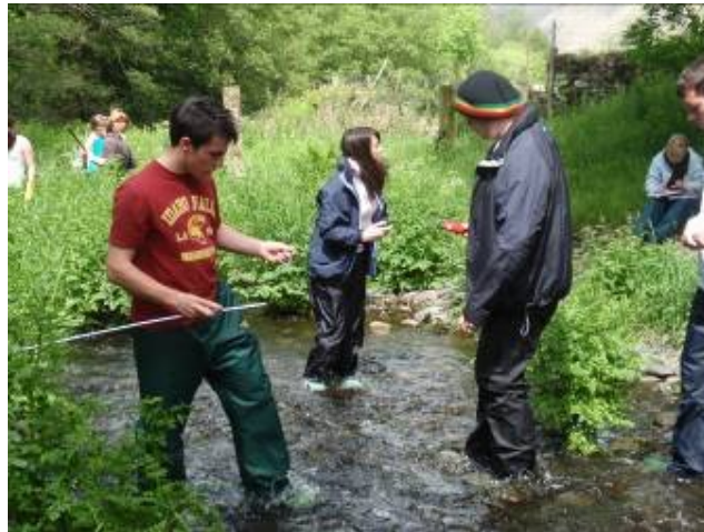
Year 12 on a Biology visit to Derbyshire

It has been very enjoyable, but a lot harder than I thought it would be, you have to take it seriously.