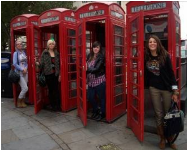
Textile students on visit to London